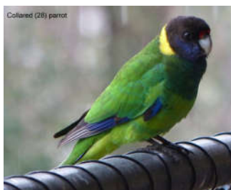
Collared (28) parrot

If the Colourful Flora wasn't enough then Steve through in the colourful Fauna